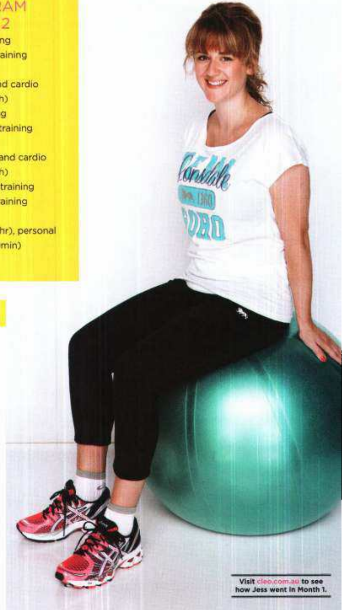
Visit cleo.com.au to see how Jess went in Month 1.