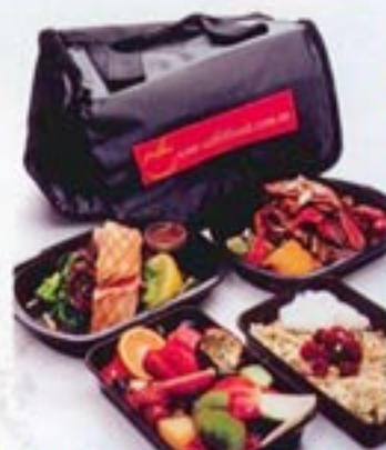
Eat Fit's plans start at $30 a day.